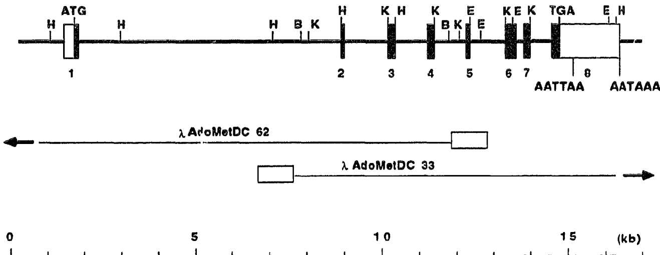
Fig. 1 Structure of the rat AdoMetDC gene. Two overlapping rat genomic clones (λAdoMetDC 62, λAdoMetDC 33) spanning over 20 kb were isolated and characterized as described in Section 2. Top, a composite map of the rat AdoMetDC gene is shown with restriction sites located as indicated: H, Hind III; E, Eco RI; K, Kpn I; B, Bam HI. The exons are depicted by boxes, and they are numbered starting from the 5'-end of the gene. The coding sequences are shown by solid boxes and the noncoding sequences are shown by open boxes. The introns and flanking sequences are depicted by solid lines. Exons were located by restriction mapping and sequencing. A scale in kilobases is shown below.

A genomic λ phage library was screened using nick-translated fragments of the AdoMetDC cDNA to isolate the rat AdoMetDC gene. The initial screening was performed using a probe covering the coding sequence of the cDNA. Two recombinant colonies yielded positive hybridization signals and the clones λAdoMetDC 62 and λAdoMetDC 33 were isolated. Restriction frag-